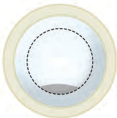
9.5 mm or larger diameter prep with no markings (stromal side mark and no peripheral attachment point "V" notch).