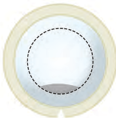
9.5 mm or larger diameter prep with "V" notched scleral rim indicating peripheral attachment point.