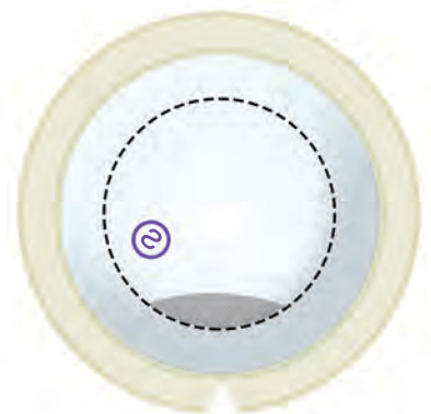
9.5 mm or larger diameter prep with "V" notched scleral rim indicating peripheral attachment point and "S" marked stromal side of membrane.