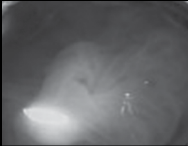
A donated retina recovered for research.

Following last year’s published research on techniques used in cornea transplantation with the Center for Bioengineering Innovation and Design at Johns Hopkins University, RMLEB furthered its reputation as a competent partner in medical research. Our involvement in research projects at institutions around the world grew this fiscal year and we expect more published research in the coming