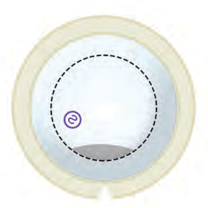
9.5 mm or larger diameter prep with "V" notched scleral rim indicating peripheral attachment point and "S" marked stromal side of membrane.