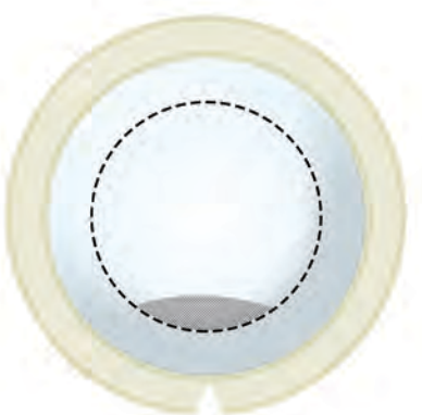
9.5 mm or larger diameter prep with "V" notched scleral rim indicating peripheral attachment point.