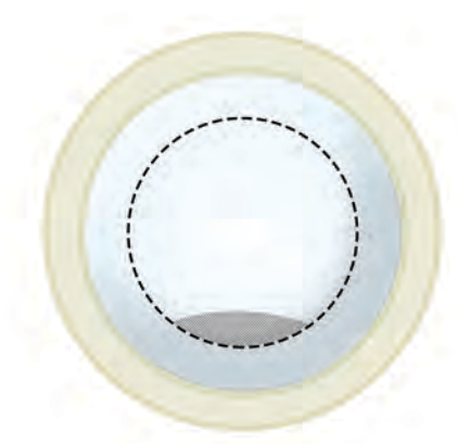
9.5 mm or larger diameter prep with no markings (stromal side mark and no peripheral attachment point "V" notch).